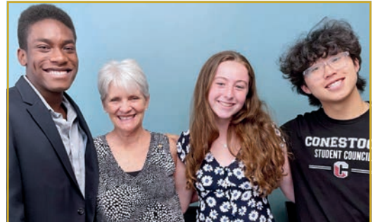
Senator Comitta with members of her summer intern team. To apply for an internship, visit pasenatorcomitta.com/contact