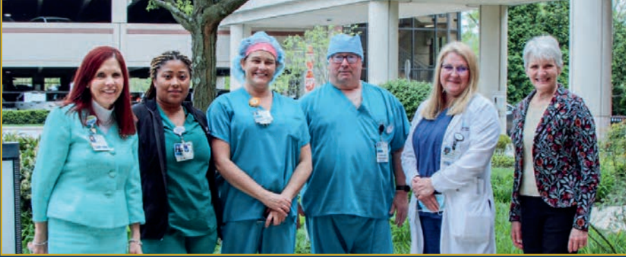
Senator Comitta with doctors and nurses at Paoli Hospital. Comitta secured millions in funding to strengthen our regional healthcare infrastructure and is working to reform the hospital closure process.